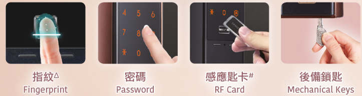
指紋 △ Fingerprint 密碼 Password 感應匙卡 # RF Card 後備鎖匙 Mechanical Keys