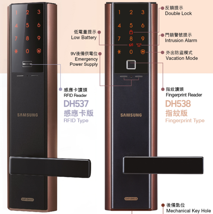
● 反鎖提示 Double Lock ● 門鎖警號提示 Intrusion Alarm ● 外出防盜模式 Vacation Mode ● 指紋讀頭 Fingerprint Reader ● 感應卡讀頭 RFID Reader ● 9V後備供電位 Emergency Power Supply ● 低電量提示 Low Battery ● 後備匙位 Mechanical Key Hole DH537 感應卡版 RFID Type DH538 指紋版 Fingerprint Type